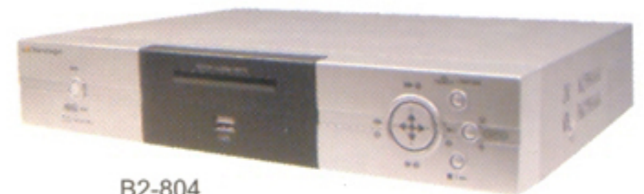
B2-804 Mid Range H.264 DVR