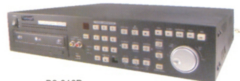
B2-816D D1 Resolution High-end DVR