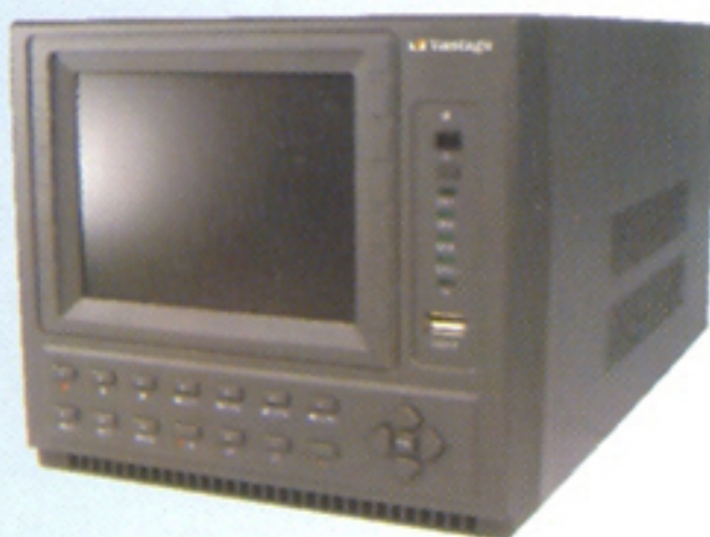
B4-A5003 ATM DVR