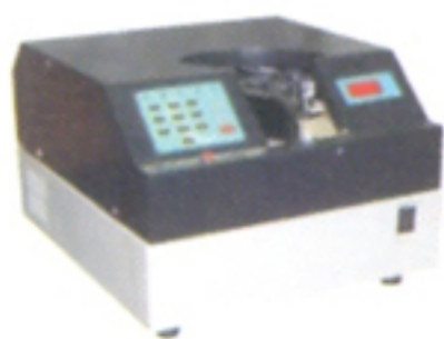
BN1500 Bundled note counting machine