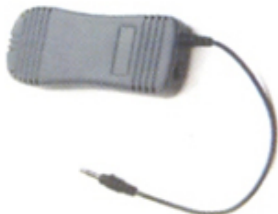
I3-ST-RF2 Self-Alert Tag