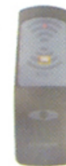
Deactivation Remote for Self-Alert Tags