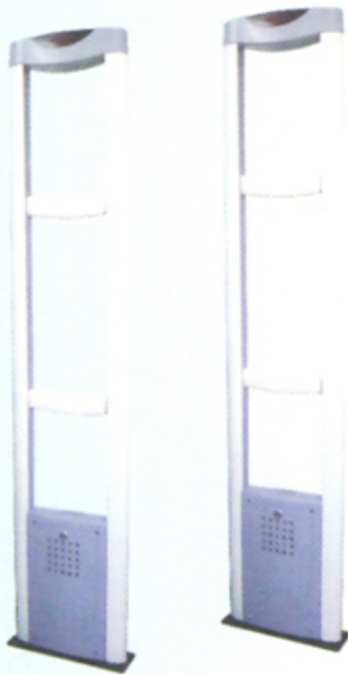
V-I1-82E Transmitter Receiver

EAS-82E is wireless communication system transmitting and receiving signals via radio frequencies. The standard operating centre of frequency is in the range 7~10MHz with bandwidth of 1MHz. It is to be used with RF labels and/or hard tags. A system is comprised of a receiver antenna, a transmitter antenna and a power supply. It is highly beneficial and has wide application in the retail industry.